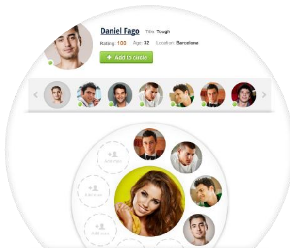
A woman has one circle of men

The central concept of the service is a Circle, which contains a photo of a woman surrounded by a certain number of admirers. A woman can have only one circle of male followers, from which she makes her selection, while a man can join many women's circles. Various activities, going on in the circles, allow women to get rid of unwanted men and choose those they like. Circles have limited lifetime and finite number of participants.